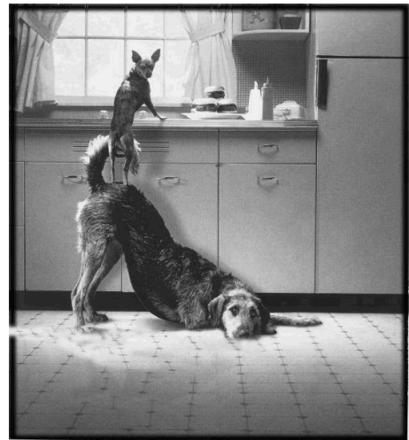
Get their attention

Find out if they are ready to listen to you? Are they distracted, if so, move to a location where there is less outside activity. Is this the right time; maybe they are hungry or tired. To get them to pay attention it may only take a pat on their head or to just call their name so they know you are there. When you are in conversation with another person, you can intuitively tell when someone has not heard what was said. Our response is “Are you listening to me?” It is the same feeling with an animal.